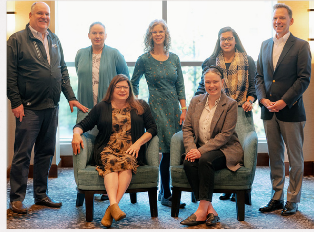
Members of MGMA's Government Affairs Council and staff at 2022 Medical Practice Excellence: Leaders